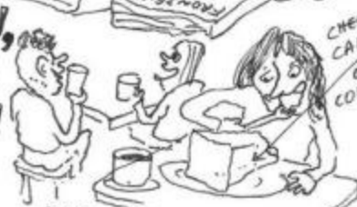
DAGMAR'S AFTERNOON OFF