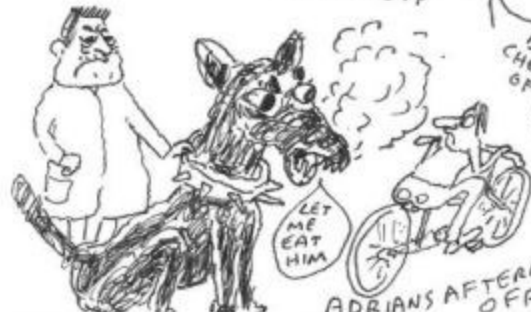
ADRIAN'S AFTERNOON OFF

70'S-GOD FUCKING AWFUL DERANGED FLORAL GEOMETRIC DESIGN BY THE WAY, CHECK THE BACK OF THE PLATES THIS IS A BAVARIAN LATE 20TH CENTURY TREASURE HOARD